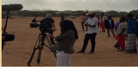
Filming in Dadaab