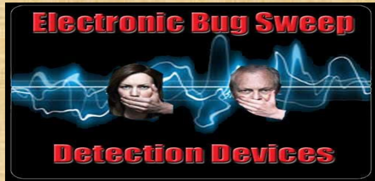
Electronic Bug Sweep

As a company that values Cyber Security, Data Protection & Privacy, our staff consists of individuals passionate about their area of expertise. This makes us different from our competitors. We ensure you make the most of the solutions you invest in, both in the short and long term.